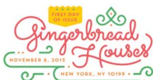
Digital Color Pictorial

After applying the first-day-of-issue postmark, the Postal Service will return the envelopes to the customer by U.S. Mail.