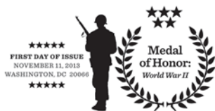
Black and White Pictorial

Medal of Honor Stamps Special Cancellations PO Box 92282 Washington, DC 20090-2282