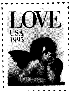
Copyright USPS 1994