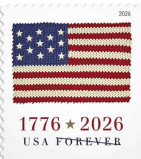
09 Juni Pane, Coil, Booklet