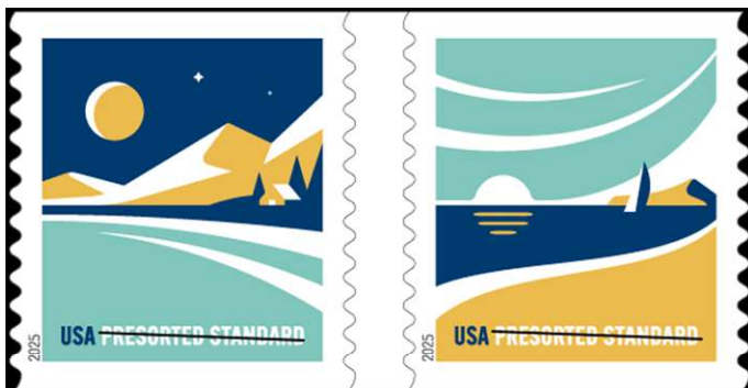
(10c) American Vistas (Presorted Standard) – 21 Feb