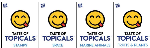
From: Wikipedia & ATA site

ATA online store is the spot for ordering ATA handbooks, show and first day covers, Taste of Topicals™ series and a variety of gifts and philatelic specialty items. All items are listed with domestic postage included unless otherwise noted.