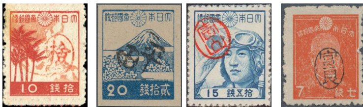
Amami Okinawa Miyako Yaeyama