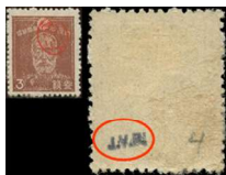
A “J.V.B.” Example

Okinawan Provisionals can be found in many conditions - most with or without gum as issued, usually with glassine residue ( Okinawa is very humid ) backing and stamped on back with “J.V.B.” (Joe Victor Bush) who acquired most of the then available postage just after Okinawa began issuing its own stamps.