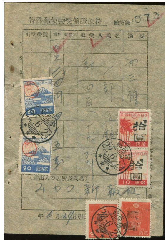
Ryukyu Islands 3X15, 3X28 & 3X31 Miyako Provisional Stamps on Bulk Mail Receipt (note: dates based on the reign of the Emperor – YYMMDD or 22.6.24 translates to 1946 June 24 Gregorian)