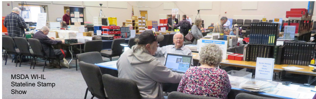
MSDA WI-IL Stateline Stamp Show