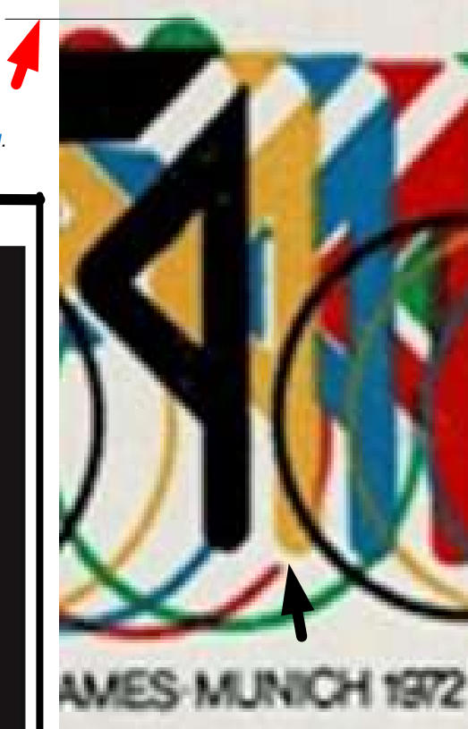
Scott 1460 FIDO – Red shifted down Note red – green helmet