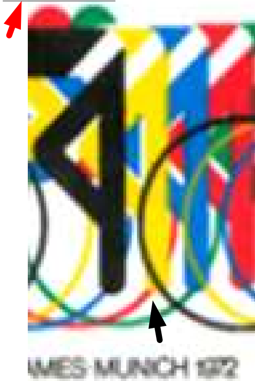
Scott 1460 Normal – Red Ring merges with yellow leg