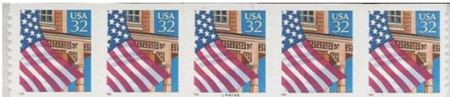
Scott 2519A #444444

While there are other factors such as condition and centering, the philatelic value of a PNC single or strip highly depends on its plate numbers with some plate numbers commanding higher catalog values due to their rarity and strong collector interest. For more information on this issue (Scott 2915's), see the 2020 Edition of the Scott US Specialized Catalogue .