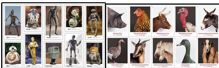
Star Wars Droids