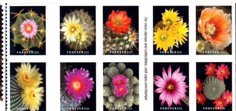
Best Definitive /Special