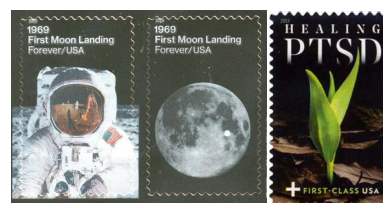
Most Important Commemorative