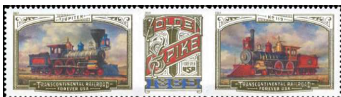
Overall Favorite / Best Commemoratice

Note: you can also use the drop-down menus at the top of the screen if you do not want to use the "Alt-A" key sequence.