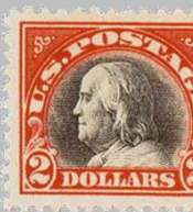
High Value Franklin