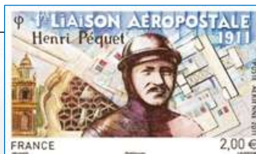
The Pilot: Henri Pequet French 1961 Commemorative Stamp

After this event, other nations began experimenting with fixed wing mail delivery including the United States.