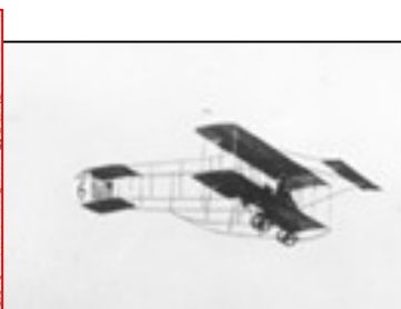
The Aeroplane: 1910 Humber-Sommer biplane