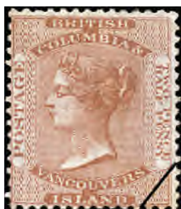
1860 Joint Issue

BC Overprints – Take one 1865 3 Pence Stamp, print with different color inks and overprint decimal values (save money) since the population of the colony was in decline from 1866 – 1871 due to gold being discovered in other regions of controlled by the Hudson Bay Company (e.g. Alberta – the next British Colony).