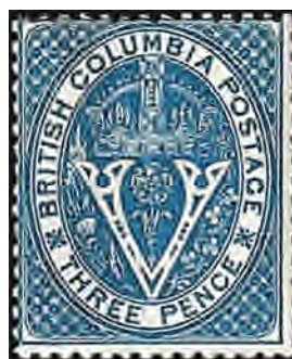
BC Issue 1865