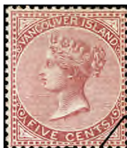
1865 Vancouver Island Decimal Issue