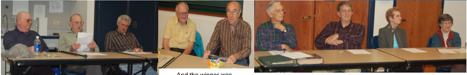
And the winner was ..