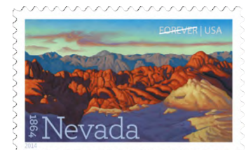
Nevada - 150 Years