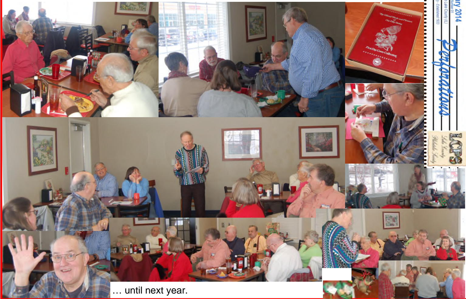
... until next year.