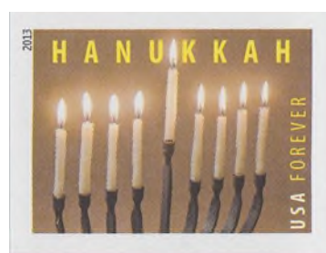
Hanukkah Scott 4824