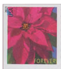
Poinsettia (ATM) Scott 4821