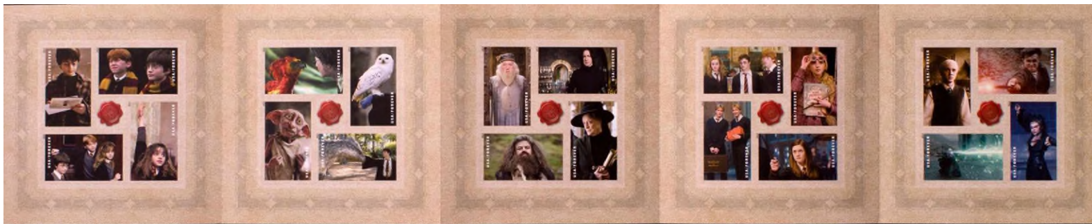
Harry Potter Booklet: Scott 4825 - 4844