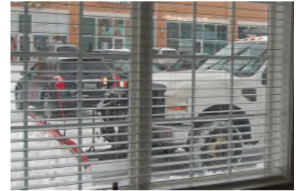
View Outside Golden Corral