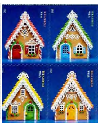
Gingerbread Houses Scott 4817 - 4820