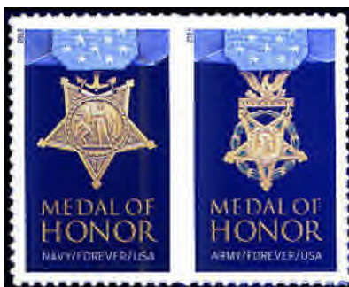
Medal of Honor WWII Scott 4822-4823