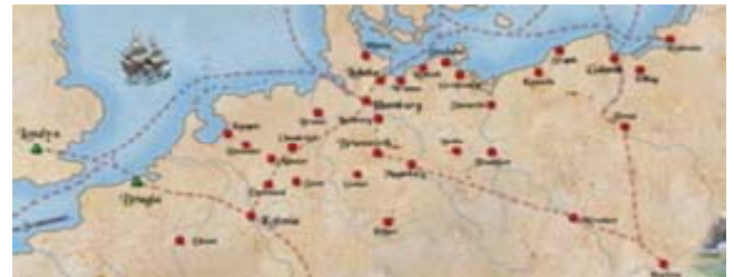
Service Area: Northern Europe 1620's

In the middle ages, there were postal services in Europe but none of them are in general use. Postal services in the middle age were exclusively used for trade guilds (such as the Metzger Post of Germany served the guild of butchers), merchants of the Hanseatic League, Venice and the Italian city states, universities, and religious houses and orders.