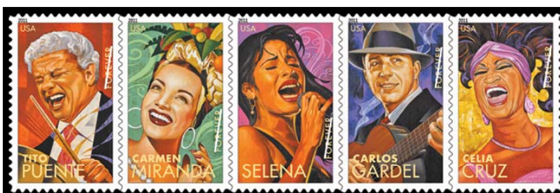
Latin Music Legends - March 13

Topical collecting provides an inexpensive way to collect stamps and has been proven as a way to get youngsters interested in the hobby (and for old philatelist, something to do as national collections become expensive to maintain). The beauty of the collection is it allows the individual to collect purely for our own pleasure, classify the material as he wants and not worry about format — no two topical collections can ever be the same. .