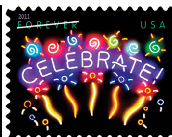
Celebrate - March 25