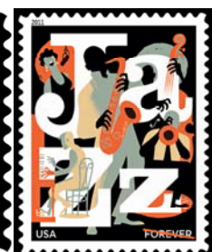
Jazz - March 26