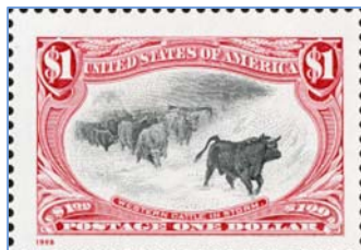
Scott 3210, 2209h