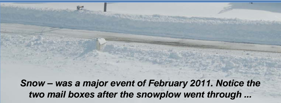
Snow – was a major event of February 2011. Notice the two mail boxes after the snowplow went through ...