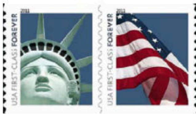
Coil Pair of New Forever Stamps

I was in error last month. The USPS will issue two more stamps in coil format on 1 December.