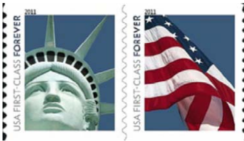
Coil Pair of New Forever Stamps

I was in error last month. The USPS will issue two more stamps in coil format on 1 December.