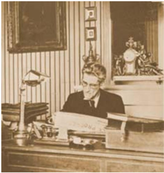
Jean de Sperati (1884 - 1957) at his home 'Claire de Lune' in Aix-les-Bains, France

Jean de Sperati was born 1884 in Pisa, Italy. However he spent a large part of his life in France. As a child in Pisa and later in France, Sperati began to collect stamps. He was particularly interested in the printing techniques, as well as photography which was in its infancy at that time. Relatives owned a postcard factory as well as a paper mill. Through this, Jean de Sperati was able to obtain copious knowledge of photography, print technology and chemicals. These formed the basis for his eventual self described career as a stamp "reproducer/artist".