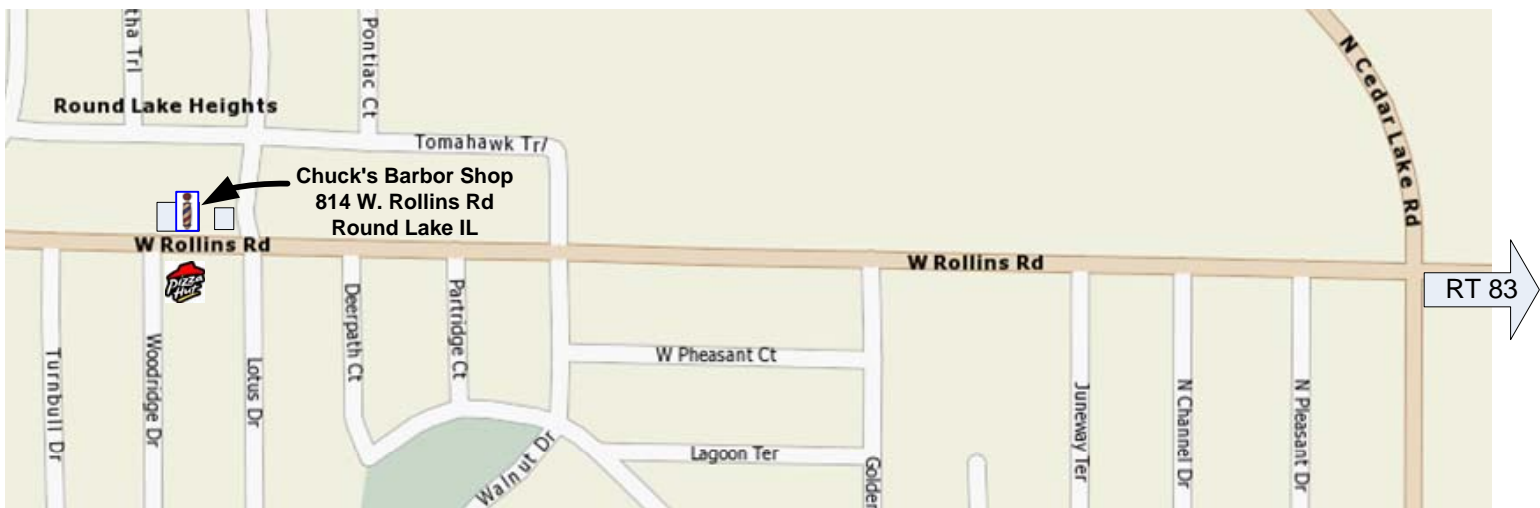
Map to Sunday's Stamp Sale