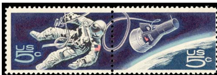
Scott 1331 & 1332