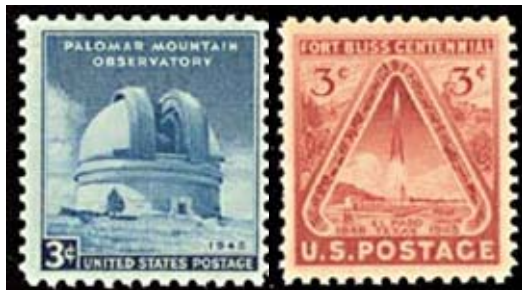
Scott 966 3¢ Mt. Palomar Observatory