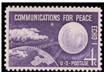
Scott 1173 4¢ Echo 1 - Communications for Peace

It would be 12 years before the US would issue another space related stamp - the first successful communications satellite, Echo 1 on 15 December 1960.