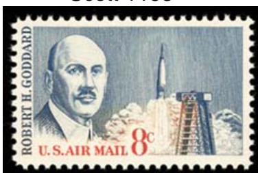
Scott C69 8¢ Robert Goddard (1882-1945)

In 1964, we saw the issuance of an air post stamp honoring Robert Goddard, seen by most, as the father rocket propulsion. His efforts were ridiculed/ignored by all but the Germans during his experimentation starting the 1910's to his death in 1945.