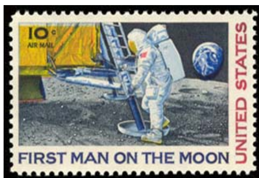
Scott C76 10¢ First Man on the Moon