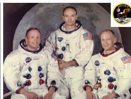
The Apollo 11 crew from left to right: Neil Armstrong, Commander; Michael Collins, command module pilot; and Edwin E. Aldrin Jr., lunar module pilot