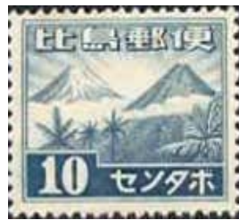
Philippine Islands Under Japanese Occupation