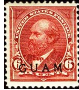
Guam Scott 11