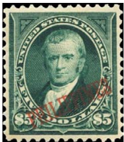
PI Scott 225