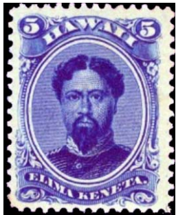
Hawaii Scott 32

On occupation, the US government overprinted current BEP designs with the names of the territories. This method of localization ended in Cuba (1902) when it became an independent nation, Guam, in 1901, when the island became a federal territory (though local guard mail stamps were issued in 1930) and Puerto Rico in 1934 when it was granted Commonwealth status and used general US postage issues.