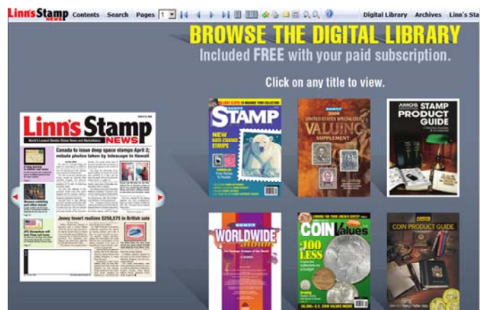
Additional publication are also available

Another feature is the ability to look at past issues that are stored in Linn's achieves.