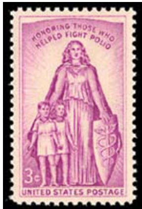
Scott 1087 1957 December 15

For over 50 years the Post Office has helped in the campaign make people aware of disease and health issues that affect the nation.