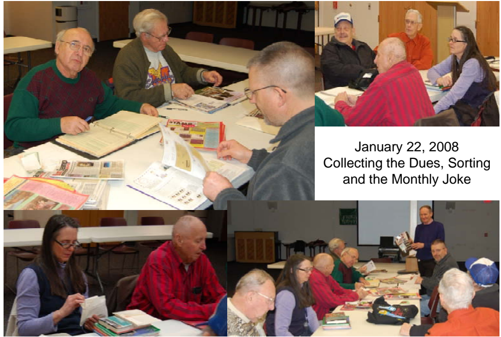
January 22, 2008 Collecting the Dues, Sorting and the Monthly Joke

This month we will look at possible stamp designs to commemorate the clubs 75 years.