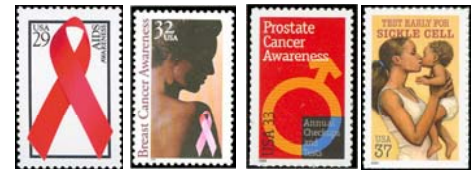
Scott 2806 Scott 3081 Scott 3315 Scott 3877

The latest in this 'series' highlights Alzheimer's - a debilitating memory disease that is making it impossible for the affected elderly to live a full life.