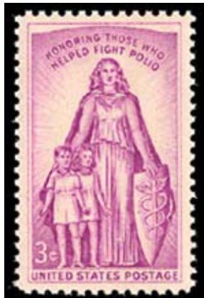
Scott 1087 1957 December 15

For over 50 years the Post Office has helped in the campaign make people aware of disease and health issues that affect the nation.