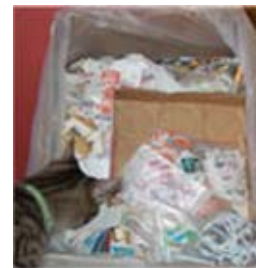
The APS Box

We still have a box of APS material to look through and use to see if we can garner interest in a new generation of stamp collectors.