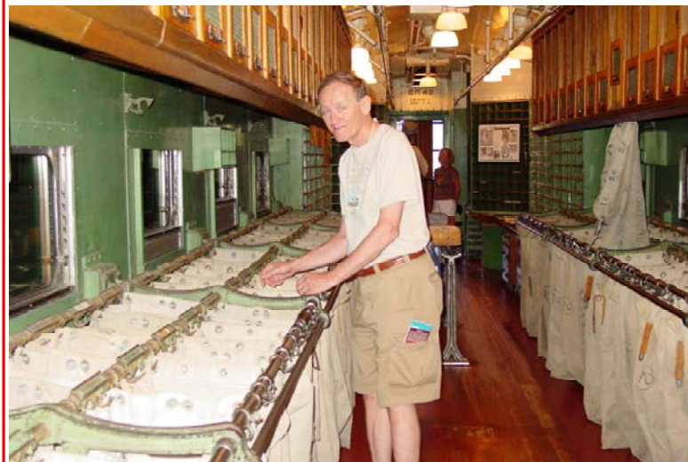
Mail Sorting Train Car - Train Museum in Sacramento