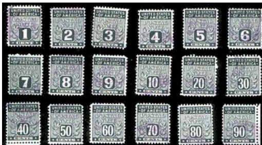
Complete Postal Note Stamp Set

The second, postal note stamps, only ran from 1945 to 1951 and was used to augment the Postal Money Order service for fund transfers of under $1.00. The process required the purchase of one or two stamps, affixing them to a three-part US Postal Note Card. The card was then cancelled by the postal clerk, with one part going to the purchaser, one part staying at the issuing office and the third part (with the stamp(s)) going to the party payment was due. This person would then go to the local post office, present the card to the postal clerk who then pay him and keep the card for recording purposes. The cost of the service was that of the postal card rate (2¢) to send the card and Postal Note Stamps through the mail.