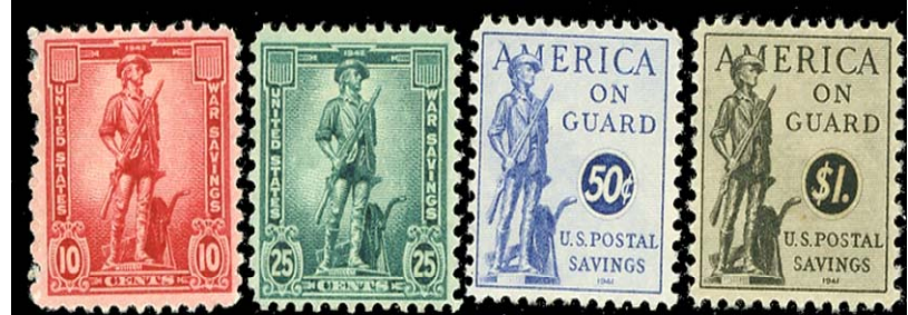
Series 1941 War and Postal Savings Stamps

Next meeting: 7PM on Tuesday 22 May 2007 at the Warren-Newport Library 224 North O'Plaine Road, Gurnee IL