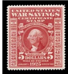
Series 1925 War Savings