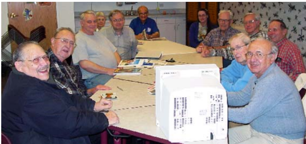
April Meeting – Gathered around the TV for Egypt/Israel Presentation