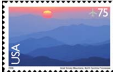
75¢ Great Smoky Mountains USPS #: 568240 [PSA pn/20] $15.00 Friday, February 24, 2006