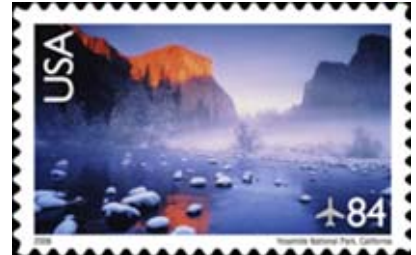
84¢ Yosemite National Park USPS #: 568440 [PSA pn/20] $16.80 Friday, February 24, 2006