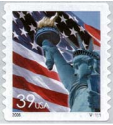
39¢ Liberty & Flag USPS #: 783700 PSA PNC [3K roll] February 8, 2006