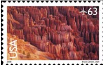
63¢ Bryce Canyon USPS #:568540 [PSA pn/20] $12.60 Friday, February 24, 2006